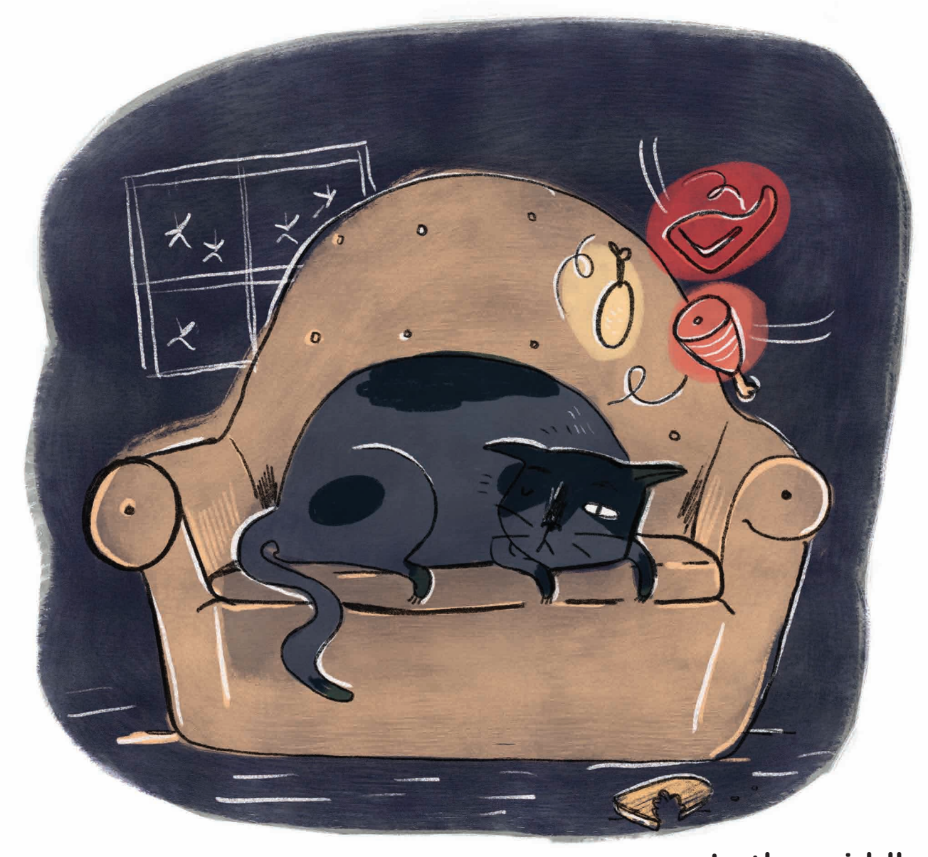
In the middle of the night, he woke up.