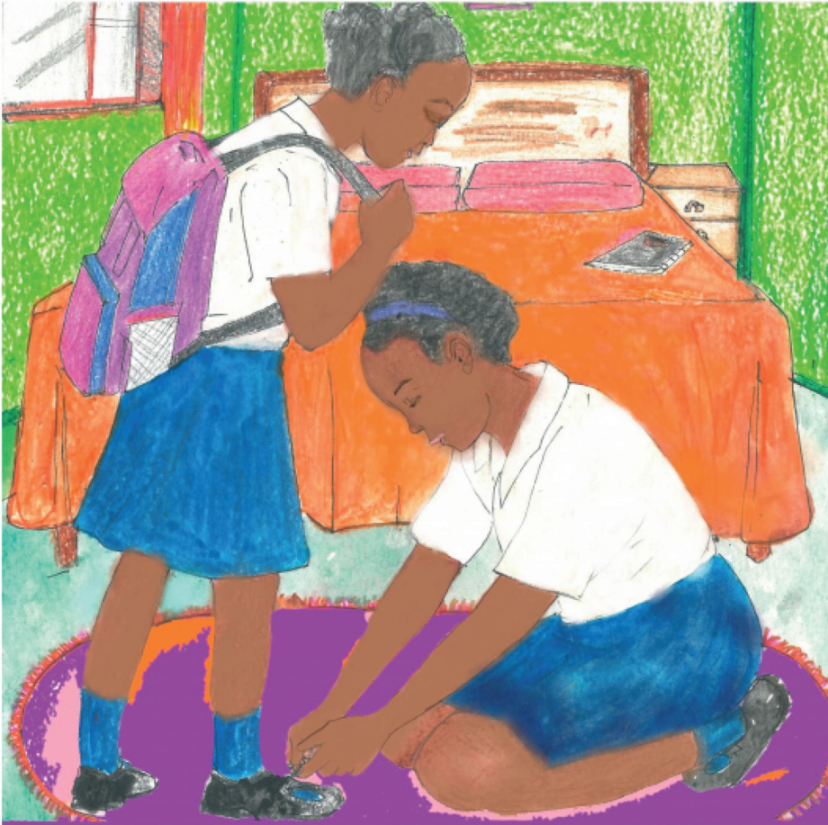
UResege uyangisiza ukwembatha izambatho zami zesikolo ekuseni.