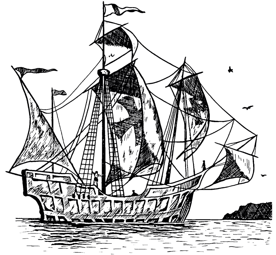
Illustration from International Illustration: The Art of Reading 3.0